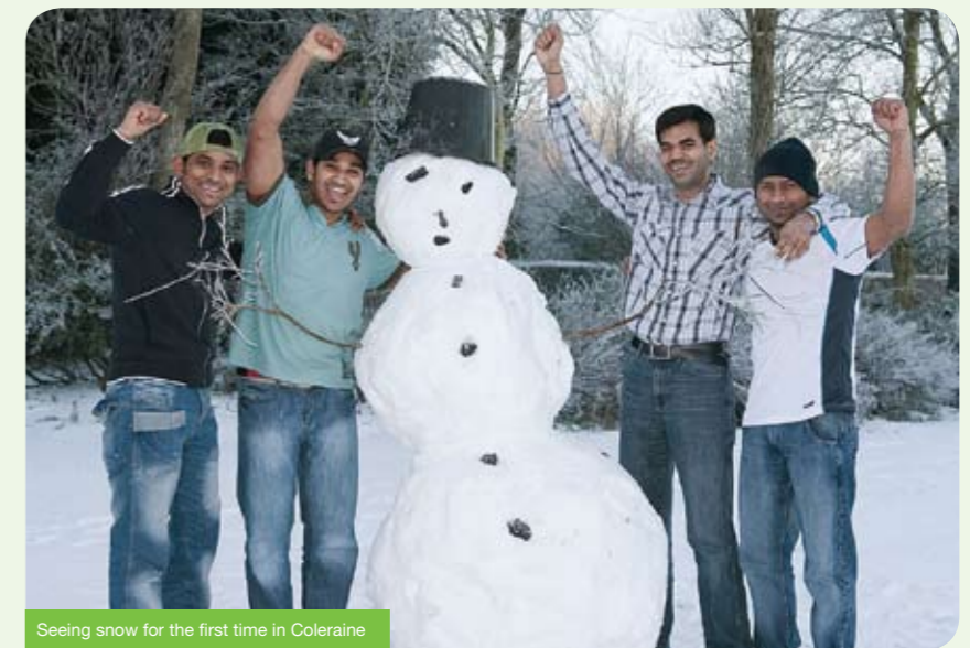
Seeing snow for the first time in Coleraine