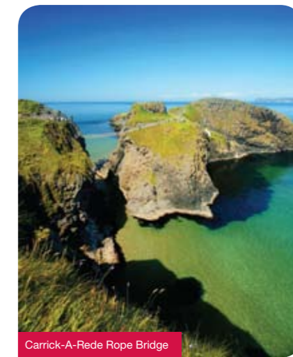
Carrick-A-Rede Rope Bridge

Today, more than ever, Northern Ireland is global in outlook. We are a changing country, growing and learning every day. We are proud of our country and the future that we want to be part of – and we want you to be part of that future too.