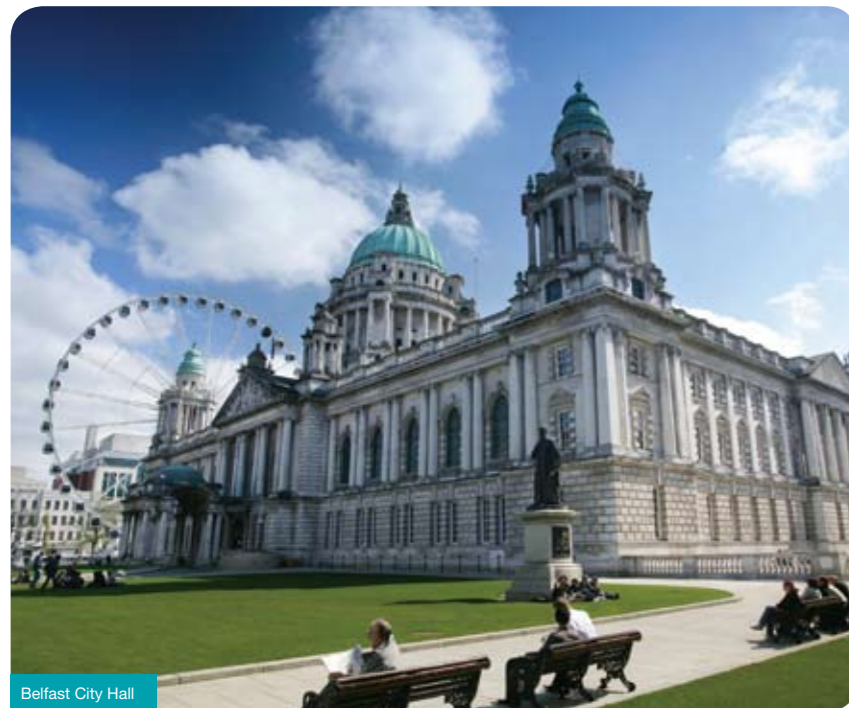
Belfast City Hall

Come to the University of Ulster and you'll meet students and staff from around the world – currently we have students from over 80 countries studying with us. So while you'll probably meet people from your own home country, you will also have a great opportunity to meet people from many other countries – including Northern Ireland!