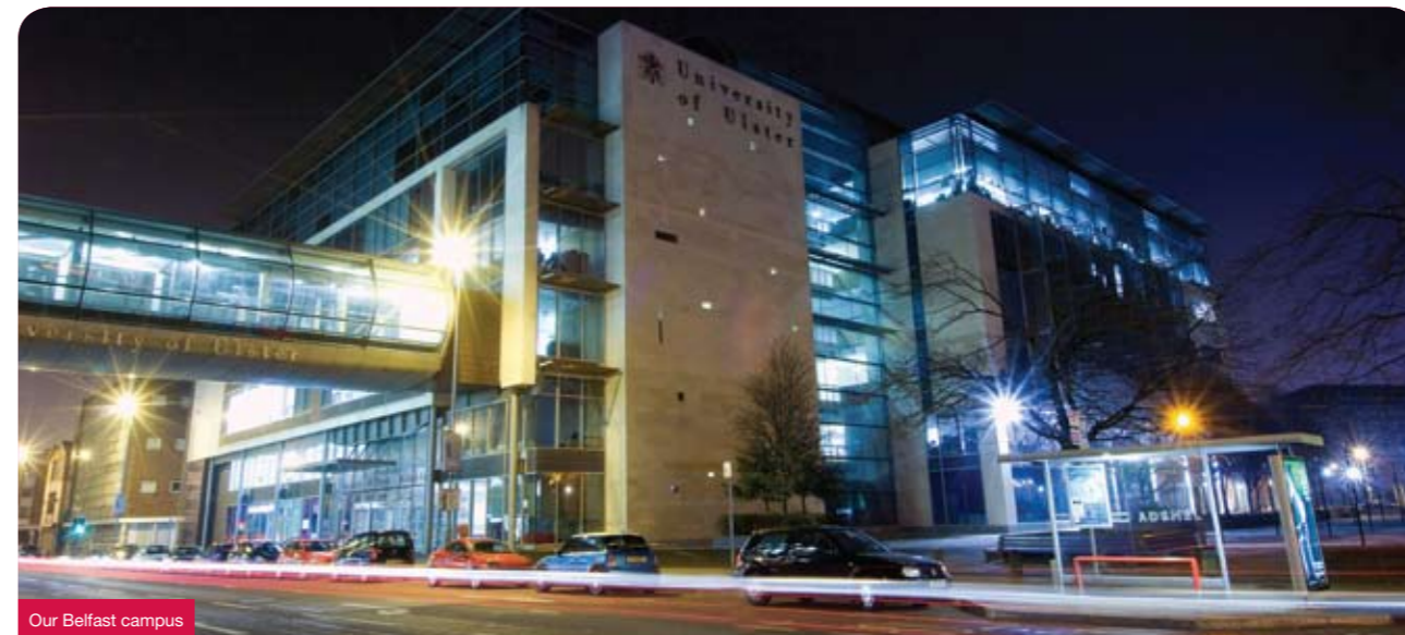
Our Belfast campus