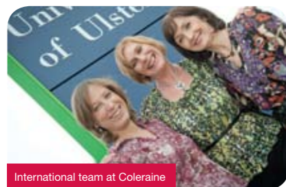
International team at Coleraine

We're delighted that you are considering studying at the University of Ulster . Join us and, as well as gaining a highly-valued British degree, you'll immediately be part of a friendly and welcoming institution.